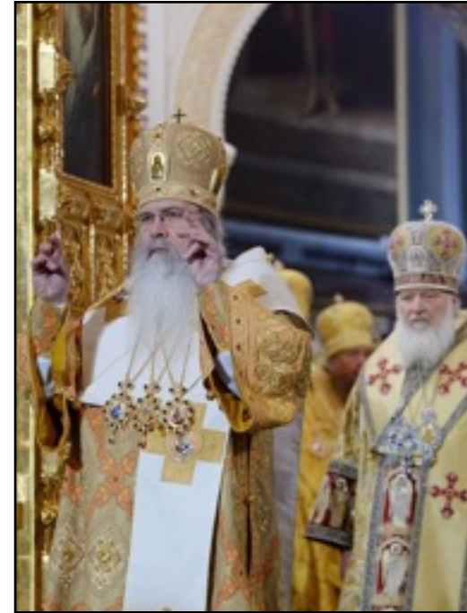
His Beatitude Metropolitan Tikhon serving last weekend with His Holiness Patriarch Kirill at Moscow's Christ the Savior

Today's Readings: Ephesians 2:4-10 Luke 13:10-17