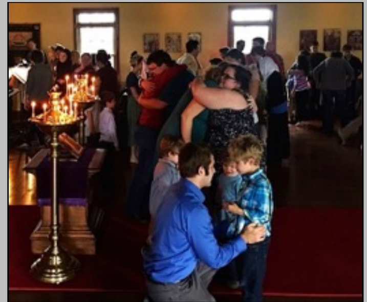
Forgiveness Vespers 2016

Epistle Reading: 13:11-14:4 Gospel Reading: Matt. 6:14-21