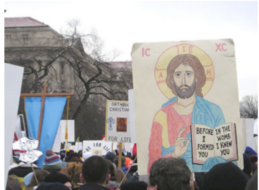
Gathering of Orthodox Christians at the 2014 March for Life Washington D.C.

St. Athanasius Orthodox Church 926 South Main Street Nicholasville, Kentucky 40356 www.athanasiusoca.org