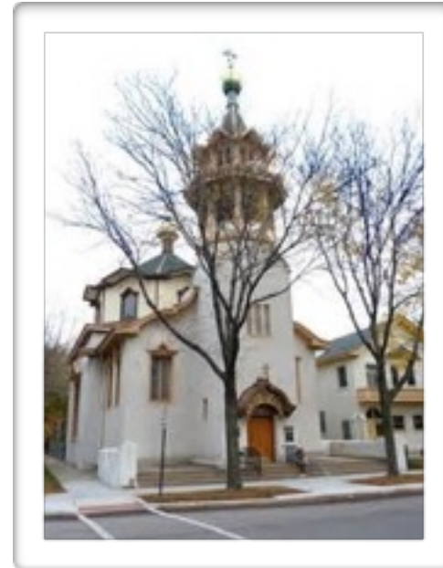
Holy Trinity Cathedral in Chicago (originally St. Vladimir's Church) was built under the leadership of St. John Kochurov whose feast day is October 31.

St. Athanasius Orthodox Church 100 Lime Lane, Nicholasville, Kentucky 40356 www.athanasiusoca.org