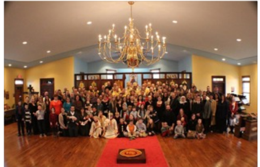
2015 Dedication with Archbishop Nikon

Today's Readings: Colossians 3:12-16 Matthew 25:14-30