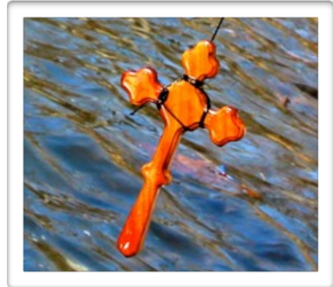
2015 Water Blessing at Lake Mingo

Today's Readings: Ephesians 4:7-13 Matthew 4:12-17