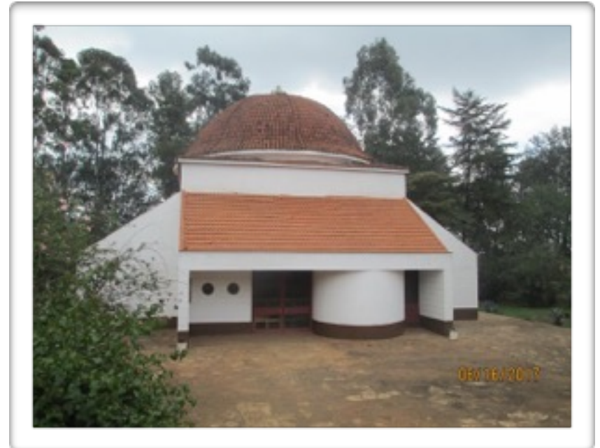
Chapel at the Seminary in Kenya, Africa Orthodox Patriarchal Ecclesiastical School of Makarios III

Today's Readings: Romans 5:1-10 Matthew 6:22-33