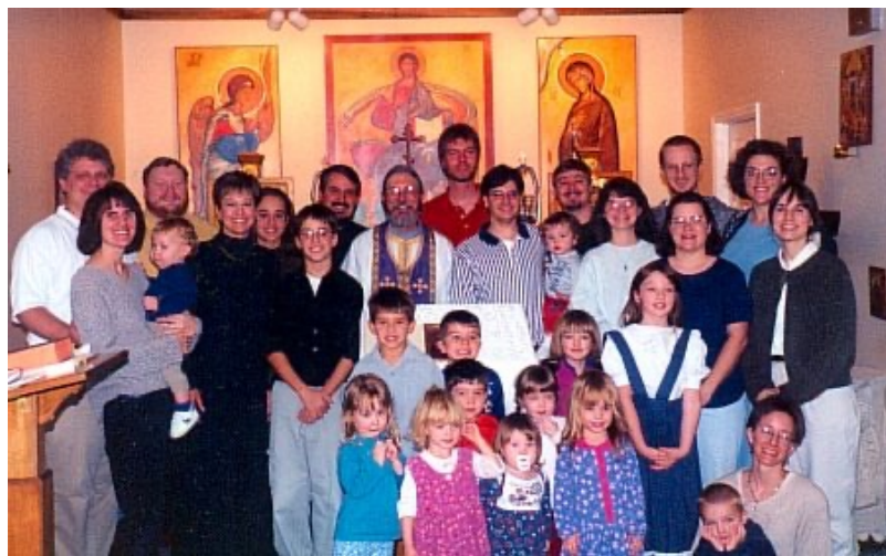
These are the founding members of our parish. Who can you identify?

Wednesday Vespers begins at 6:30pm. The fall teaching series "Living an Orthodox Life" follows at 7:20pm in the parish hall. Session 2 (this week) will explore the story of our parish and pack what it means to be a part of a parish community. The first session from last week is on YouTube for viewing.